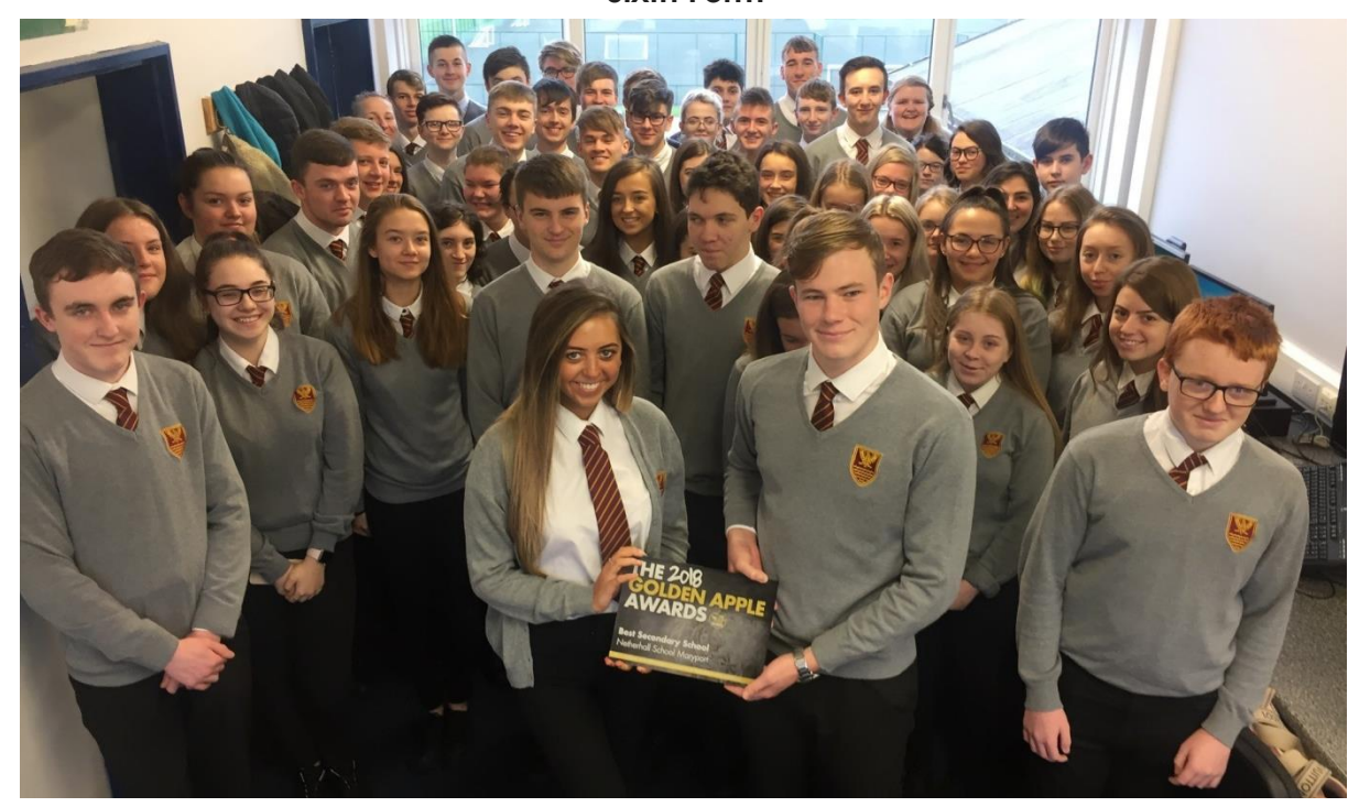
Rotary Club Maryport