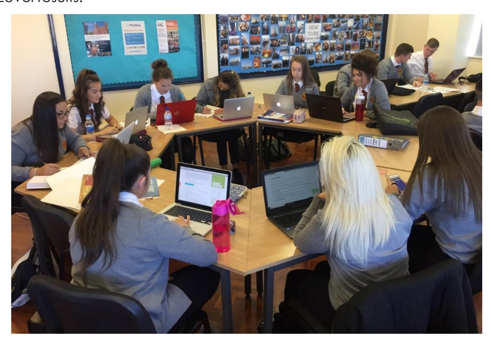
Year 13 students researching university courses and drafting their personal statements.

Year 13 students have had a fantastic start to the new term and enjoyed a university application day on Wednesday, 5<sup>th</sup> September. Students have been hard at work researching university courses and future careers, while also drafting their university application personal statements. I would like to thank all Year 13 pupils for their highly professional attitude and am excited at the prospect of all that can be achieved by the students as we look to build on this summer's excellent A Level results.